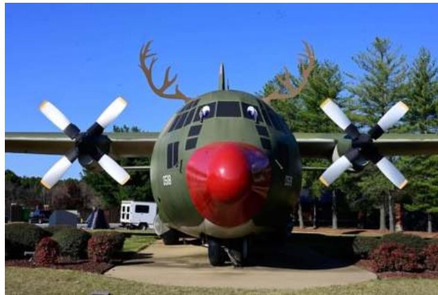
Rudolph the Red-Nosed C130 – Little Rock AFB, Air Mobility Command

There are 154 (possibly more) S.A.L. Squadrons in New Jersey, plus County Executive Committees. Surely you've done something important lately. Let the SALute , and the rest of New Jersey's Legion Family, know what you've been up to. Pat yourself on the back, gloat if you must for a job well done. Our S.A.L. Family does so much to benefit Veterans and the community. Share your stories. Send articles and jpg photos to njSALute@gmail.com . Please be sure to ID people in your photos.