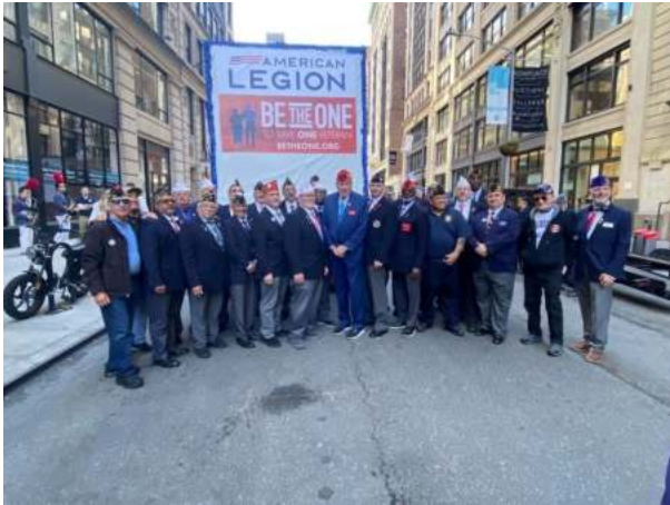
The New Jersey Crew at NYC's Veterans Day parade.