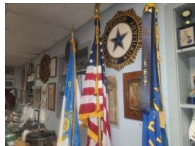
SAL Essex County Exec Committee held its Christmas party at Nutley Post 70 on 14Dec.