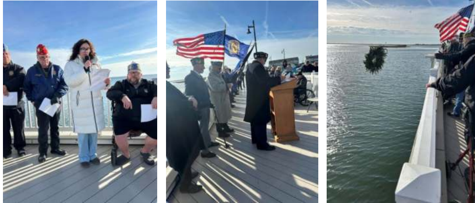
Barnegat Legion Post 232 and VFW Post 10092 Pearl Harbor Ceremony, 7-Dec.