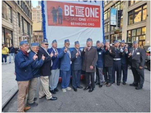
The SAL marching crew.